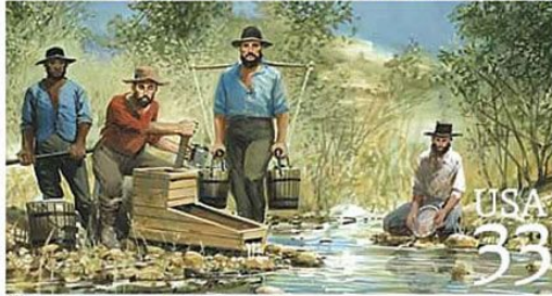
CALIFORNIA GOLD RUSH 1849

Based on what you have learned today, would you have been motivated to pursue the Gold Rush? Why or why not?